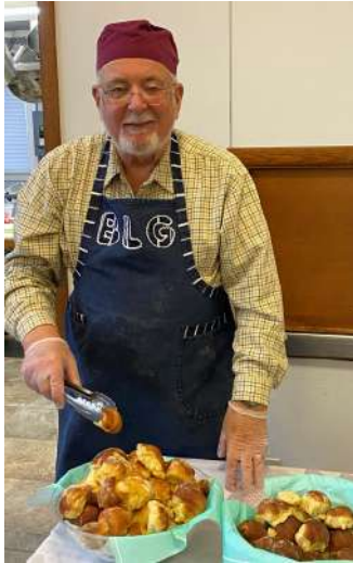
Feast of Grace November 23, 2025