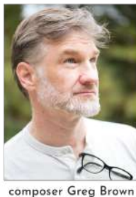
composer Greg Brown