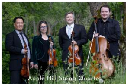
Apple Hill String Quartet