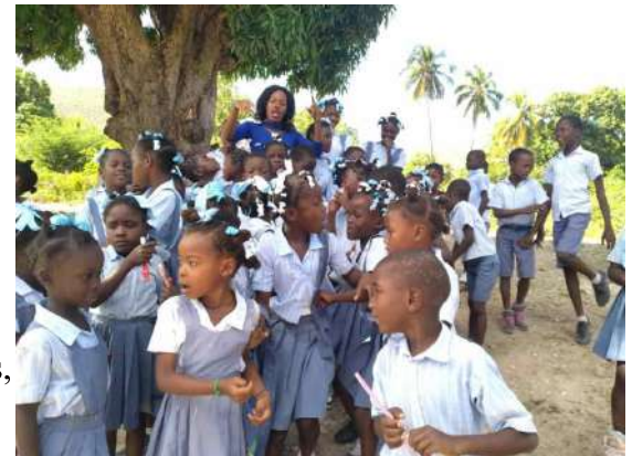
Uniforms get use!

As we all realize, the political and social situation in Haiti remains extremely difficult and volatile; but St. Matthieu's-- its students, teachers, administration-- has been amazingly resilient and determined. Please help them launch another year.